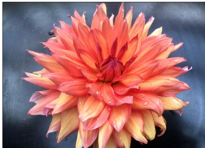
A fabulous shot of a dahlia flower

have kept fish of varying sorts in it. We even had ducks on it once. So, the point of this tale is that, for the first time in my memory, it has dried up. So too has the stream that runs out of it and heads down into Ram Spinney. In my life I've never seen it dry. Blimey, that's the kind of year we've had!