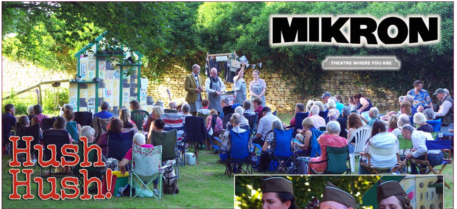
A selection of views from Mikron's performance of Hush Hush! on the 20th June.