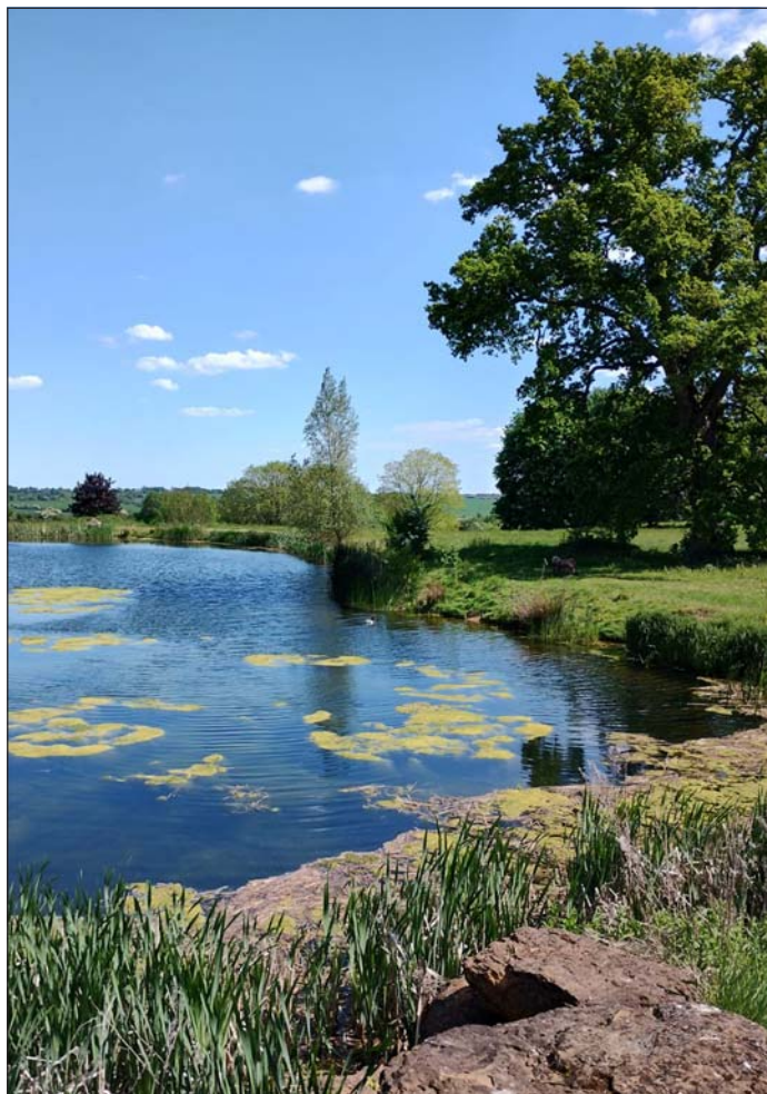
A view of the lake — just part of our glorious surroundings.

The show starts at 7pm on Friday 20th June. Bring a picnic or a bottle of wine (or both!), something to sit on, and prepare to be entertained. There will be a retiring collection.