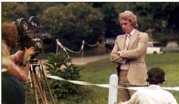
That man off the telly! In our living room! Flippin heck!

I'm just going to say that again, for affect. In North Aston, in DD's bedroom, there was a police sniper aiming a rifle out of