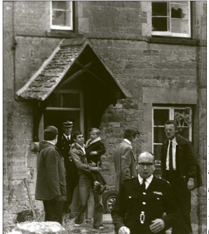
The siege ends.

One day I remember a lady ( the gunman's mother ) arrived with some police and begged him to give up. He did give up, eventually, after a long time, and within an hour or so, North Aston was back to being North Aston again, but flipping heck, it had been exciting while it lasted!