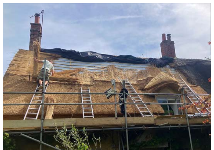
A view of the thatchers at work on Greenside Cottage.