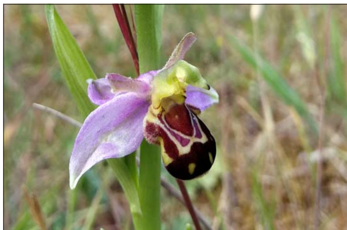
The Bee Orchids ( Ophrys apifera ) have appeared in The Park again.