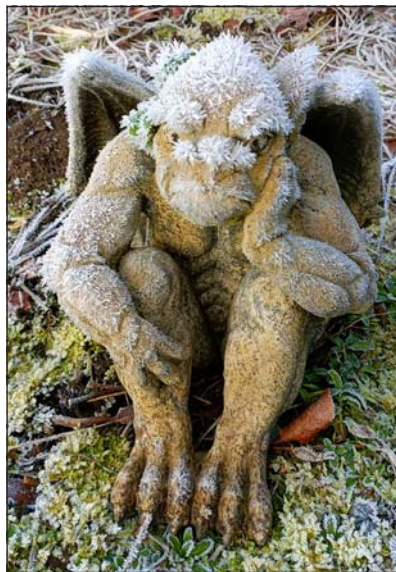
The unrelated photo from Stephen Rees shows a very glum gargoyle. Well, it was very cold last month!

In addition, 47 drivers were stopped while under the influence of excessive alcohol and 59 had been using recreational drugs.